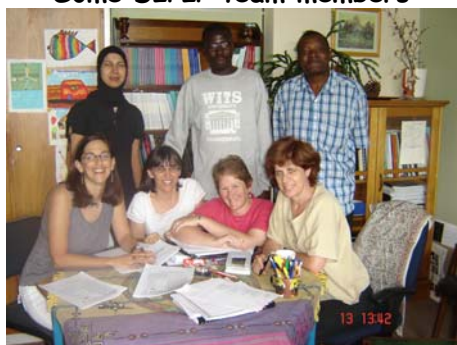
Some DIPIP team members