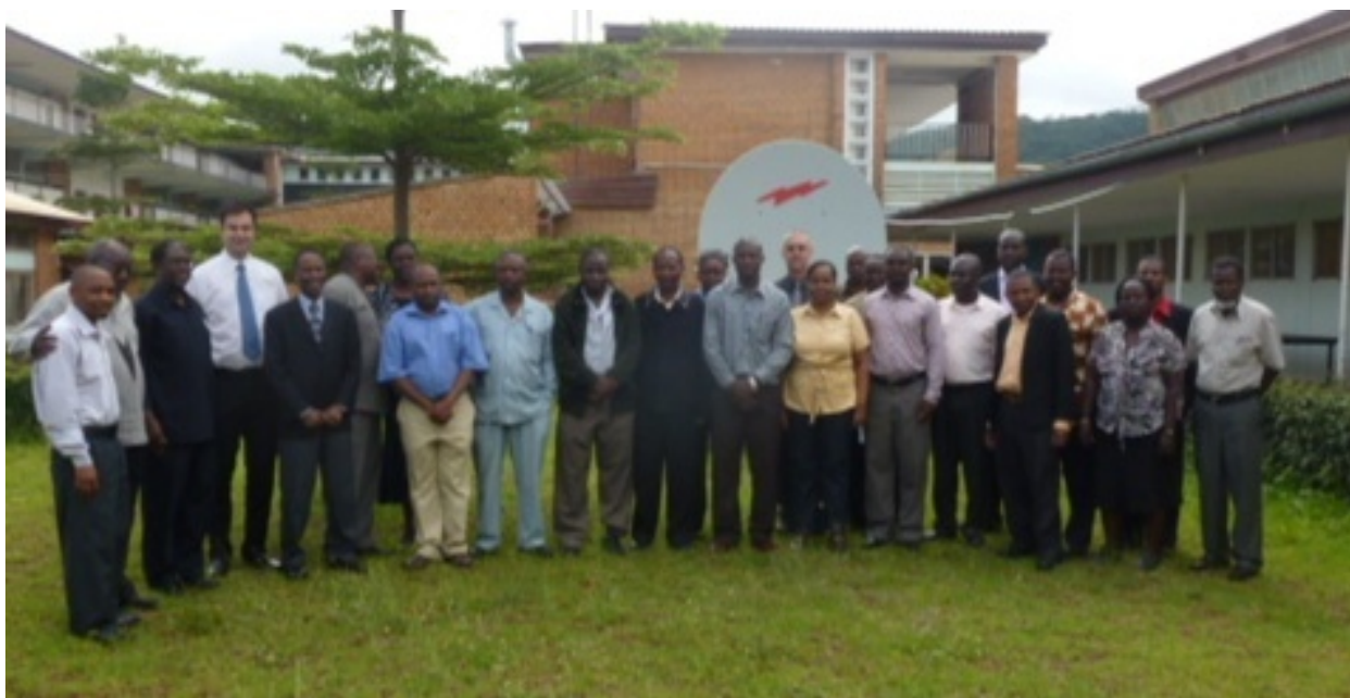
Figure 2: Group photo of the core MUCE team and facilitators