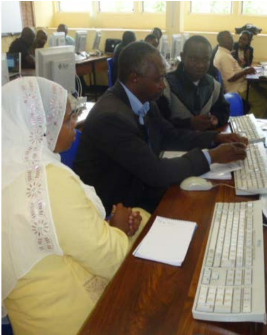
Figure 3: Workshops involved a mix of presentations and hands-on individual and group work

A key focus of this engagement with the OER concept at UDSM was to explore ways in which an informed engagement with OER could support the curriculum renewal processes that were already underway. An important departure point for the workshop was that working with OER should not form a separate project in its own right, but should rather complement and support activities that were already in motion. The workshop built upon an earlier engagement with the CVL by Saide in support of the migration of UDSM teaching and learning resources into the Moodle VLE. The result of the workshop was a process for the development and review of courses and materials.