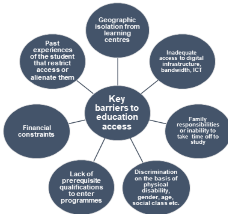
Figure 1: Barriers to access in South Africa's higher education sector

Specific barriers that Post School Education and Training in South Africa seeks to address are summarised in Figure 1.