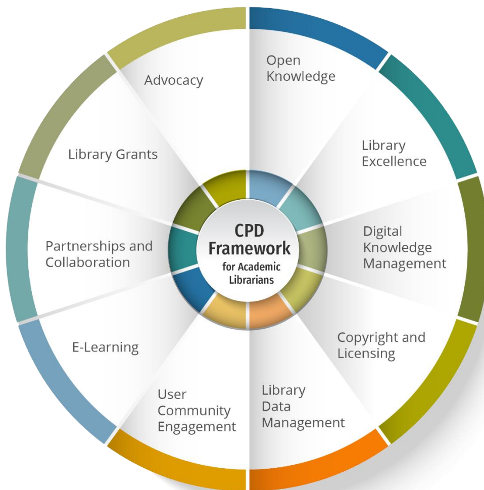
Figure 1 The CPD framework for academic librarians

While ten distinct domains have been identified, they are interconnected and often overlap. For example, there are linkages between the Open Knowledge and Copyright and Licensing domains as they both have elements concerning the management of intellectual property. Also, there are linkages to AI in the Copyright and Licensing , Digital Knowledge Management and Advocacy domains. This is because academic librarians need to understand how to ethically manage AI authoring and should be involved in developing guidelines or policies to guide its use. Where there are such linkages, the capability descriptors can serve as guidelines that indicate the particular aspect of the overlapping subject being referred to.